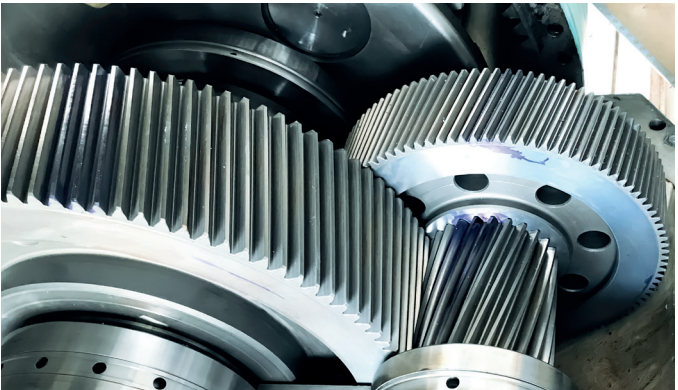
Toothed gearing system spur gear stage

The wind turbine's drivetrain plays a pivotal role in facilitating the efficient conversion of wind kinetic energy into electrical power. Our modular service concepts encompass strategies are designed with the overarching goal of consistently ensuring optimal system availability throughout the operational lifetime.