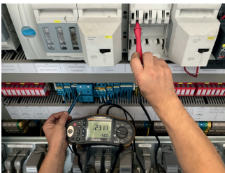
Loop impedance measurement